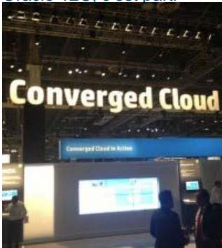
HP élargit son portefeuille Converged Cloud HP élargit son portefeuille Converged Cloud