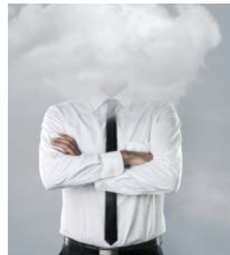
20 façons de mieux publier, gérer & protéger les API