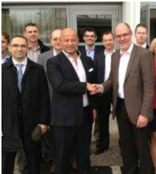
EuroCloud Congress in Luxembourg in October 2013 EuroCloud Congress in Luxembourg in October 2013