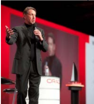
Oracle 12C, c'est parti Oracle 12C, c'est parti