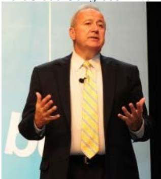
EMC renforce RSA en acquérant Aveksa, le spécialiste de l'IAM EMC renforce RSA en acquérant Aveksa, le spécialiste de l'IAM